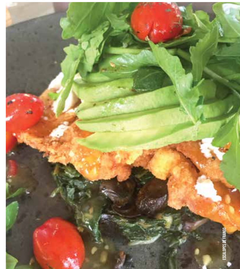
ESCALOPES DE FRANGO

100G CUBED FILLET PAN-FRIED WITH GARLIC, BAY LEAF, BUTTER, FRESH CREAM, WINE & MUSTARD SERVED WITH FRESH HAND CUT FRIES, TOMATO WEDGES & OLIVES.