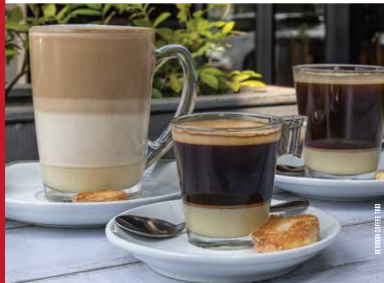
BEEMBOM COFFEE TRIO

PASSION FRUIT // R42 | MANGO // R42 | RASPBERRY // R42 | GINGER BEER // R42 NEW