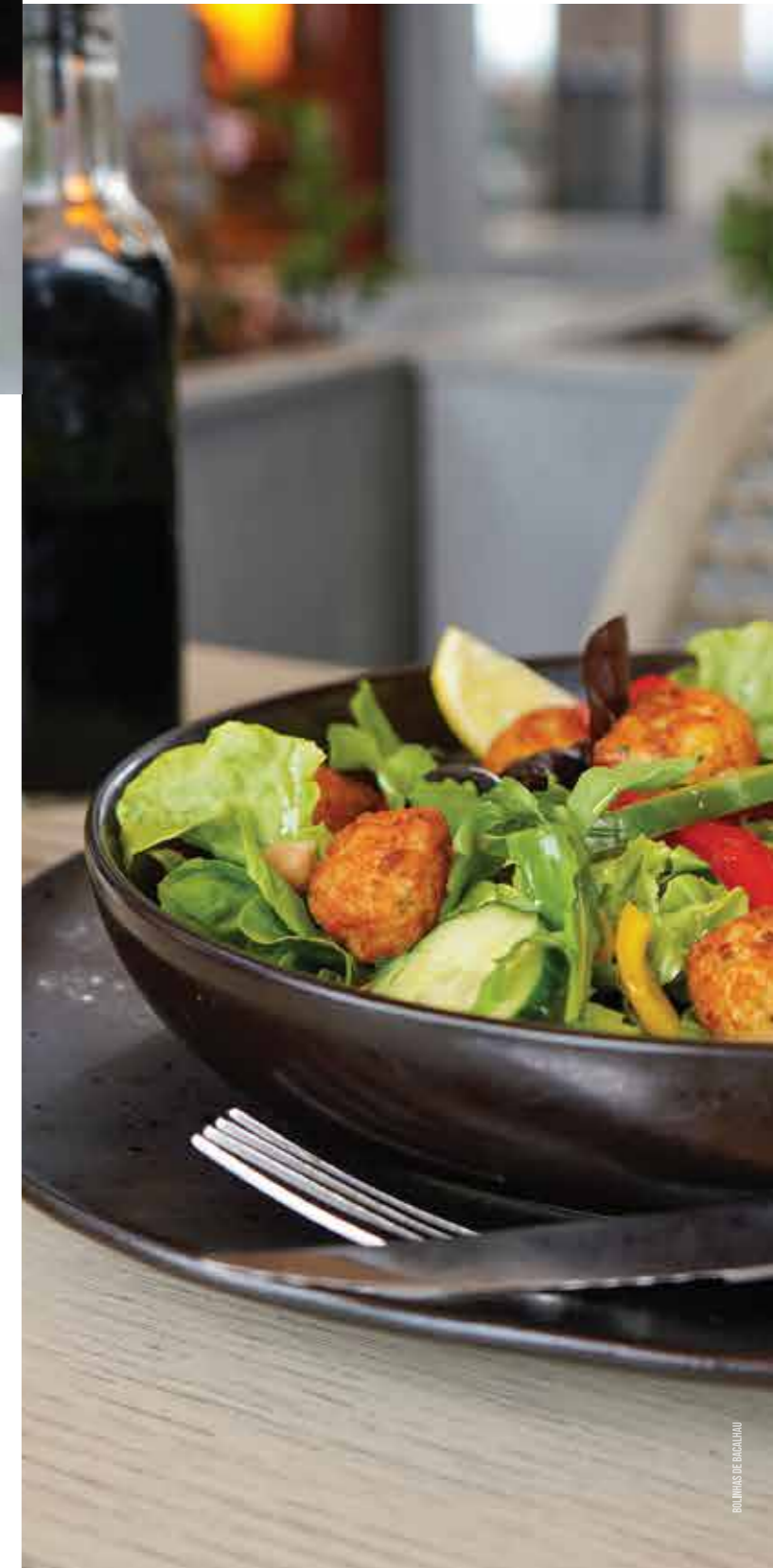
BOLO DO CACO