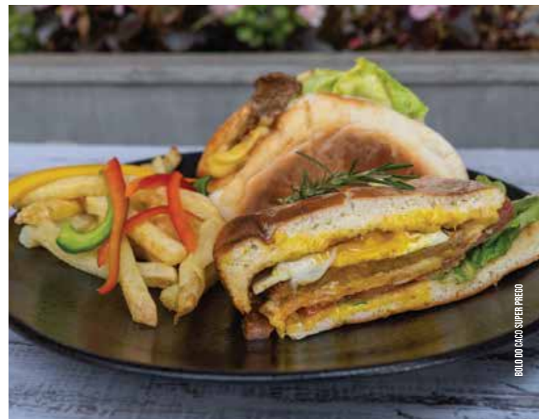
BOLO DO CACO SUPER PREGO

CODFISH BALLS, CHICKPEAS, CAPERS, OLIVES & PEPPADEWS TOSSED IN A MIXED GREEN SALAD SERVED WITH A PORTUGUESE VINAIGRETTE DRESSING ON THE SIDE.