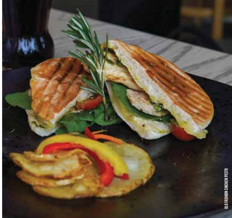
OLD FASHION CHICKEN PESTO

HALF AVO / 80G MUSHROOMS / 50G GRATED CHEESE (MOZZARELLA, GOUDA, CHEDDAR) / 50G CONTINENTAL HAM // R22 3 RASHERS BACK BACON // R22